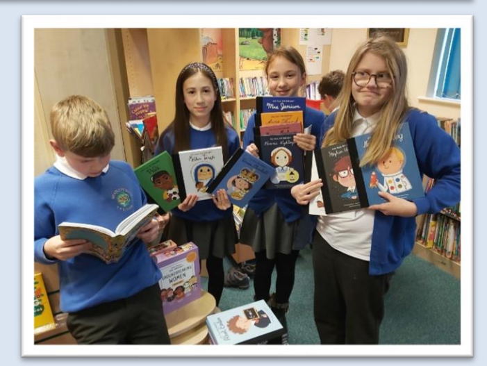
Bradleys' Both Primary