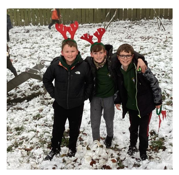
"We endeavour to encourage independent learning through a varied and vast creative curriculum"